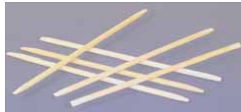
Approximately 3/16" x 7"

Orange Sticks (called so because they were originally made from orange wood) can be used for forming, shaping and positioning fine magnet wire where fingers can't reach or work comfortably. Also used for opening and holding open, contacts on relays and the such. These hardwood, non conductive, sticks have tapered ends for prying open contacts and can be trimmed and/or sharpened with a knife.